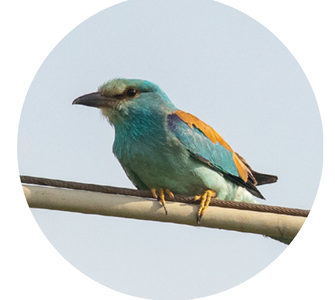
European Roller (Coracias garrulus)

As time goes by, the disused buildings, hosting the Lesser